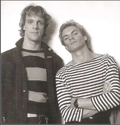
Sting © Lynn Goldsmith/Corbis

Images from the book: "éloge de la marinière sur une idée d'Armor-Lux" © 2008, Editions Parentines.