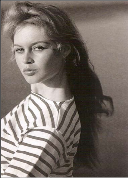
Brigitte Bardot